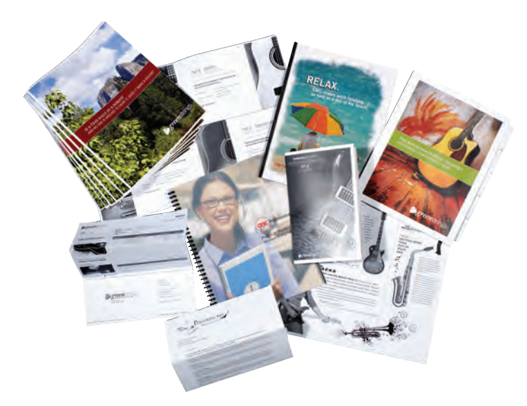
Create professionally produced reports, manuals, and newsletters. Insert a color cover and select saddle-stitch binding.

A professional finish. Choose from an expanded range of in-line finishing options, including multiposition stapling of up to 100 sheets, automatic 2- and 3-hole punching, professional punching with varied punch patterns, and saddle-stitching and face-trimming of up to 25-sheet/100-page booklets. You can even add color to your document set with the ability to insert preprinted media.