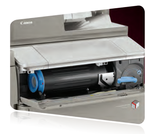
pO toner bottle

Canon's new pO (precise Output) toner faithfully reproduces detailed images and text. Across the page, solids print with an impressive evenness. Halftones and patterns retain their details, displaying smooth gradations. With our twin-sleeve technology, toner is evenly distributed across the page and throughout the print run. And in line with Canon's environmental focus, this toner helps reduce energy consumption through its ability to fuse at low temperatures.