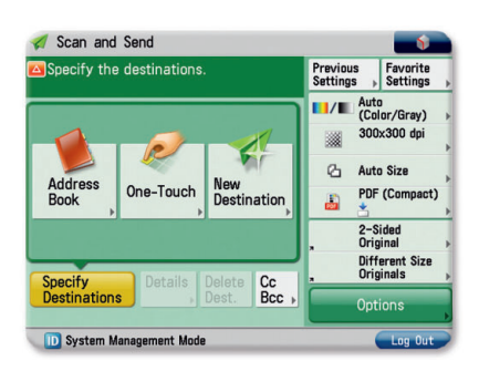
Universal Send Screen

Universal Send now offers an expanded range of file formats, including High Compression PDF/XPS, Adobe PDF Reader Extensions. Searchable PDF. and Encrypted PDF.