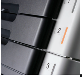
The InfoLine® display shows operating status at a glance, even from across the room. And paper drawers slide smoothly with a light pull on the easy-grip handles.