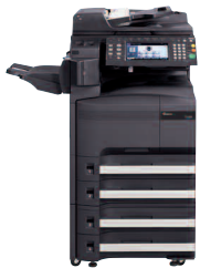
Shown with optional RADF, 500 x 2 Tray, and Internal Finisher 34.4" W x 25.5" D x 45.75 H