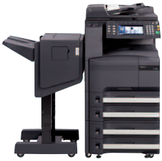
Shown with optional RADF, 500 x 2 Tray, and 1,000 Sheet Finisher 46.6" W x 25.5" D x 45.75 H