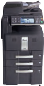
Shown with Optional DSDP and 3,000 Sheet LCT 23.8 W x 26.8 D x 48.8 H