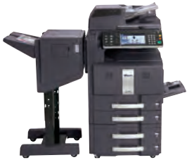
Shown with Optional DSDP, 500 x 2 Tray, and 1,000 Sheet Finisher 48.8 W x 26.8 D x 48.8 H