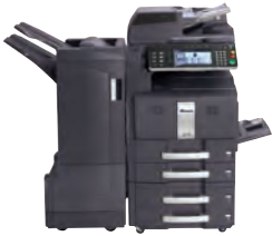
Shown with Optional DSDP, 500 x 2 Tray, and 3,000 Sheet Finisher 50.9 W x 26.8 D x 48.8 H