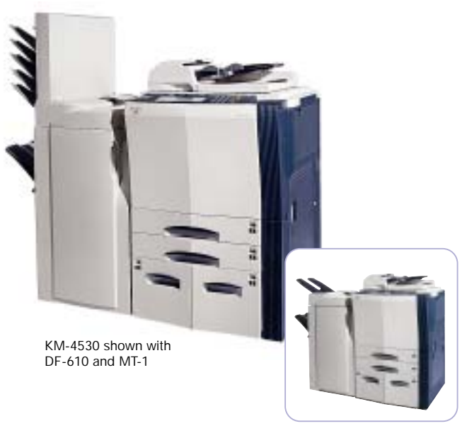
KM-4530 shown with DF-600

The KM-4530 and KM-5530 enable you to enjoy the highest standard of fast, reliable and easy to use printing. With print speeds of 45ppm and 55ppm respectively and image refinement technology enhancing your output to 1200dpi you are ensured high quality printing every time. And with a thoroughbred onboard print controller, processing time is kept to a minimum for fast document delivery.