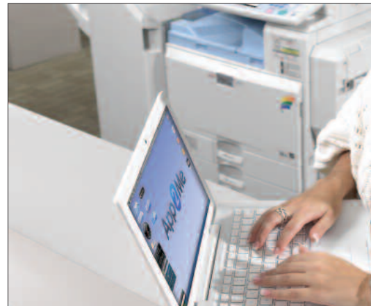
With App2Me, you can download time-saving and workflow-enhancing widgets and use them at any Lanier MFP enabled with the App2Me solution.