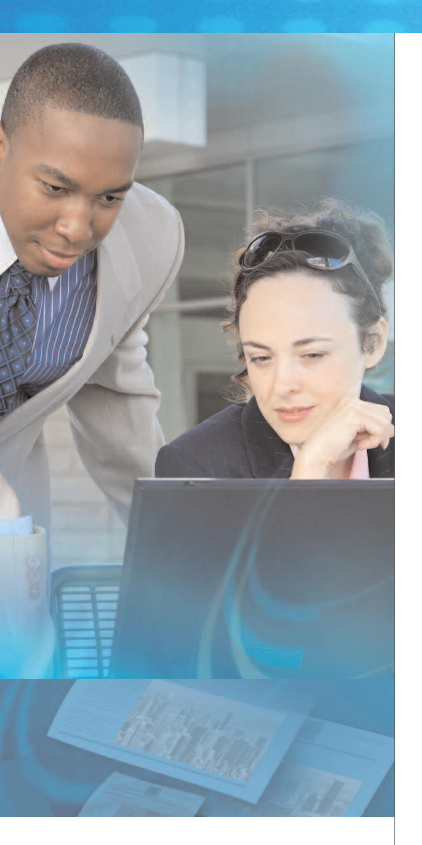
The Lanier LD390 series adds significant speed and power to your office.