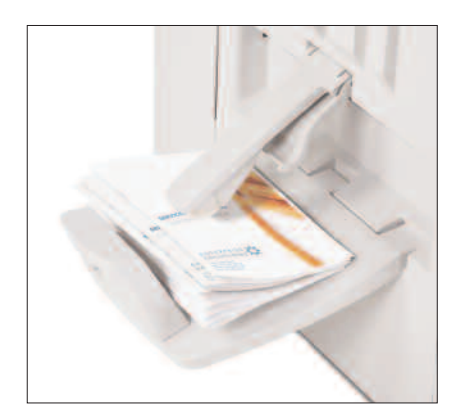
Use the Saddle-Stitch Finisher to create saddle-stitched booklets for handouts, educational and training materials, and many other applications.