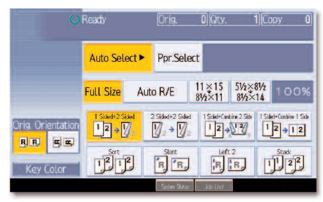
Get animated, step-by step instructions for routine tasks via the large 8.5-inch WVGA color touch screen or use the simplified display for larger fonts and icons.