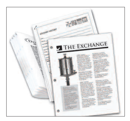
The Lanier LD390 series enables you to produce more finished documents in-house and reduce outsourcing costs.

Easy grip handles on all paper trays allow any user to reload paper quickly and conveniently.