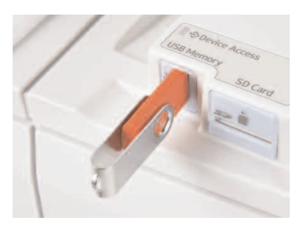
Scan originals directly to a USB drive or SD card for instant portability.