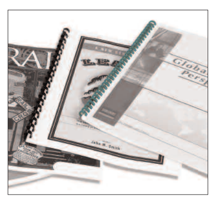
The GBC StreamPunch III delivers cleanly punched documents in several styles.