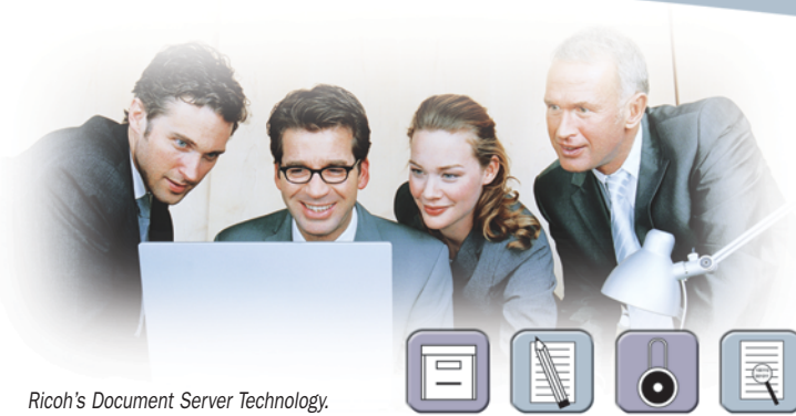
Ricoh's Document Server Technology.