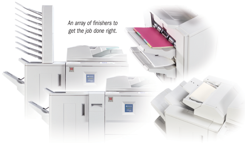
An array of finishers to get the job done right.

A variety of optional automatic finishers and an addressable mailbox will give your important business documents the proper finishing touch. And, regardless of the finisher you choose, all offer a 3,000-sheet capacity and a user-selectable two and three hole punch option, which eliminates the expense of pre-drilled paper.