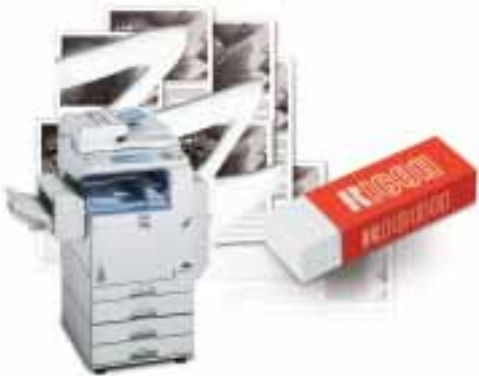
To avoid industrial spying and information leaks, Ricoh presents Data Overwrite Security Unit.

By launching the Ricoh Developer Program™, Ricoh backs its mission to bring you 'solutions that fit'. One of the tools is Ricoh's Embedded Software Architecture™, an innovative Java™ (J2ME™) compatible software platform allowing the design of customised key applications for Ricoh MFPs and laser printers, including the Aficio™3224C/3232C. For more information, visit www.ricoh-developer.com .