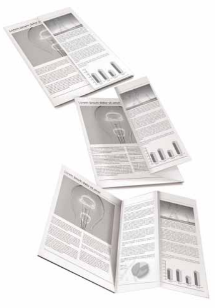
Via the Z-fold option you can smoothly insert A3 charts and tables into an A4 document.

To brighten high-value documents, insert a full colour or pre-printed front and back cover using the double cover interposer. The perfect choice to create product catalogues, user manuals and brochures with a lasting impression. If required, the interposer can also be used to insert pages anywhere else in your documents.