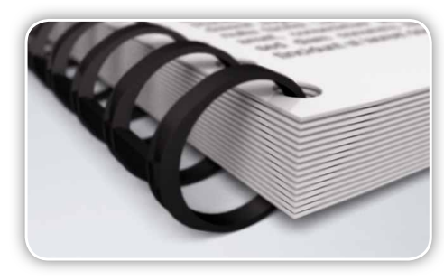
Automatic, professional ring binding.