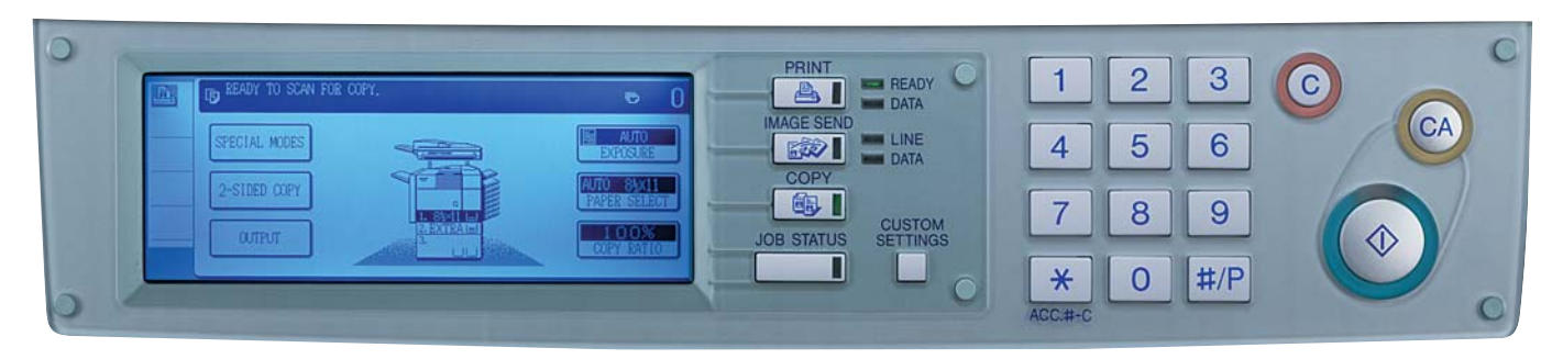
The easy to use touch screen on the control panel of the AR-M350/450 N Digital IMAGER quickly quides users step-by-step through various functions.