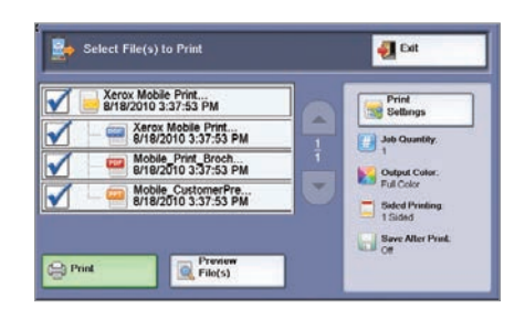
Personalized solutions you access right from the touch screen interface.

Secure. Mobile workers can print directly from their mobile devices and retrieve documents at a Xerox-enabled MFP with a secure confirmation code. Mobile professionals will no longer have to rely on others to print sensitive documents or risk leaving prints in the output tray.